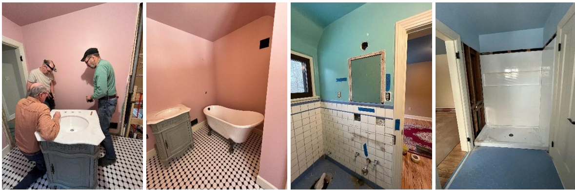
En Suite Bath: Vanity and tub installed (not shown: plumbing fixtures also installed. Jack and Jill Bath: Walls painted, tile cleaned, shower pan and surround installed.