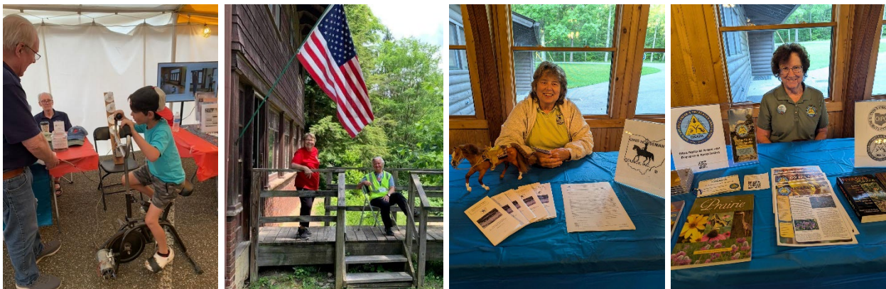
Community Day, Mill Docents, and Partners participating at our August Membership meeting.