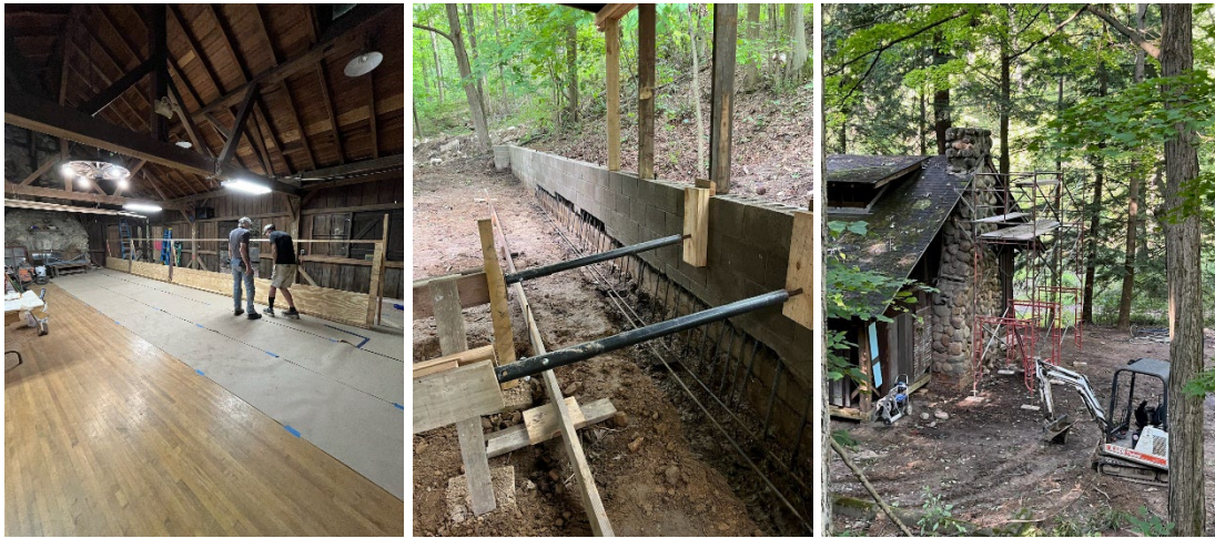
Excavate and trench for the footer, create the formwork, and set reinforcement. Masons working on rear chimney installing new stones, cement wash, and tuckpointing.