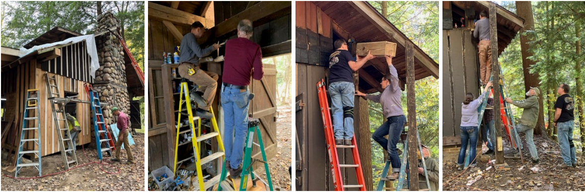
Existing damaged timber beam and bracket removed and replaced.