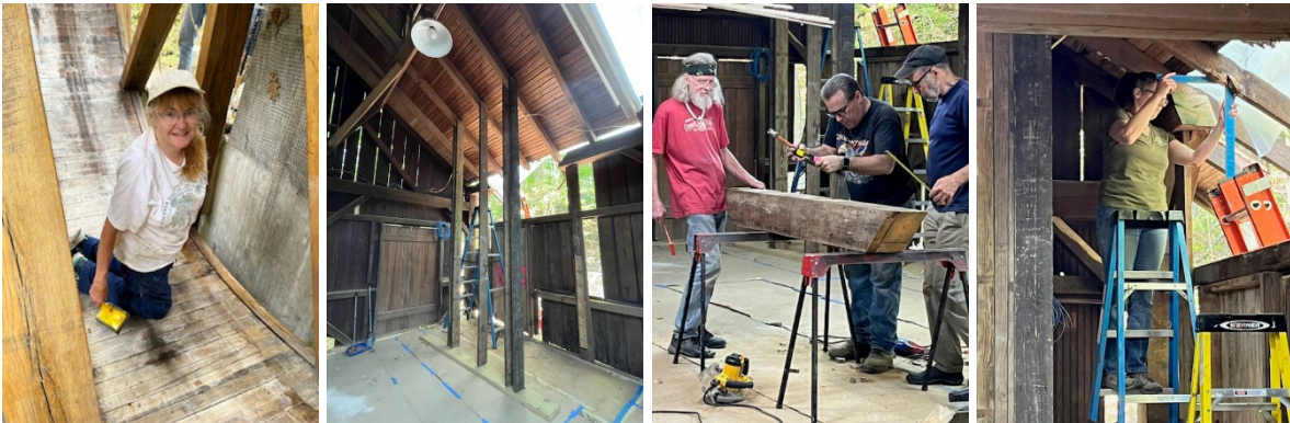
Kirby Mill Wheel cleaned and sealed prior to winter.