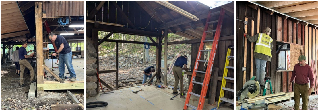
Existing bead board at kitchen removed and new board and batten cladding installed.