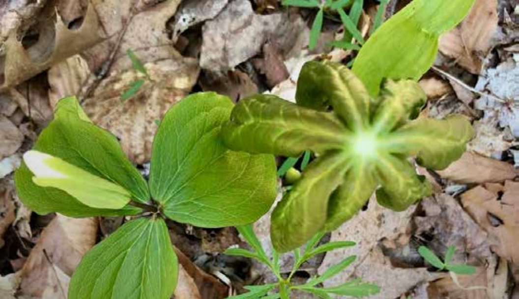
White (unopened) trillium next to a mayapple.